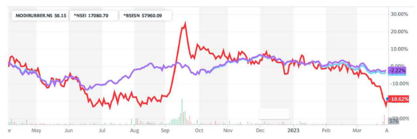
Theaforesaid chart is based on the monthly closing price of the shares of MRL vs Nifty and Sensex